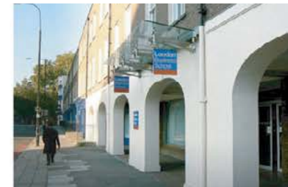
The School entrance from Park Road.

Shortly after you will see the entrance to the School signposted on your right as below: