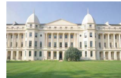
The Ratcliffe Building viewed from the Outer Circle

Career Centre Fitness Centre Library Café T